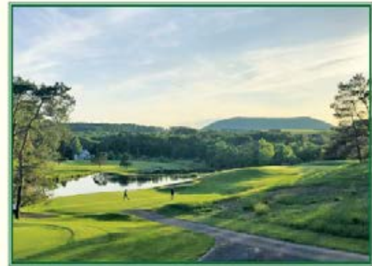
A Geoffrey Cornish Design