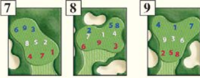
All yardages measured to the center of the green

USGA Rules govern all play except where modified by Local Rules